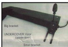
1. Secure brackets onto bottom of Venom Light Bar.