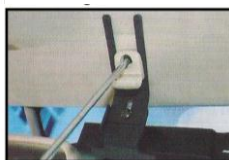
4. Slide mounting bracket firmly into the slot.