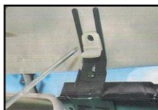
3. Loosen screw of Visor.