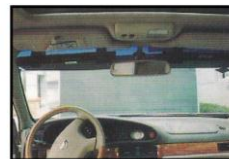
6. The Venom Light Bar installation is complete.