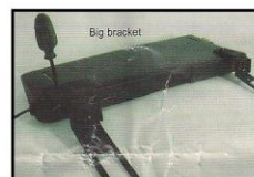
2. Adjust the big bracket according to the fit against the windshield.